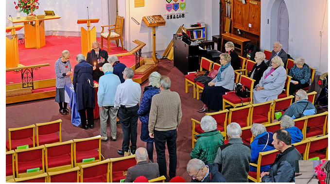
Lighting remembrance candles