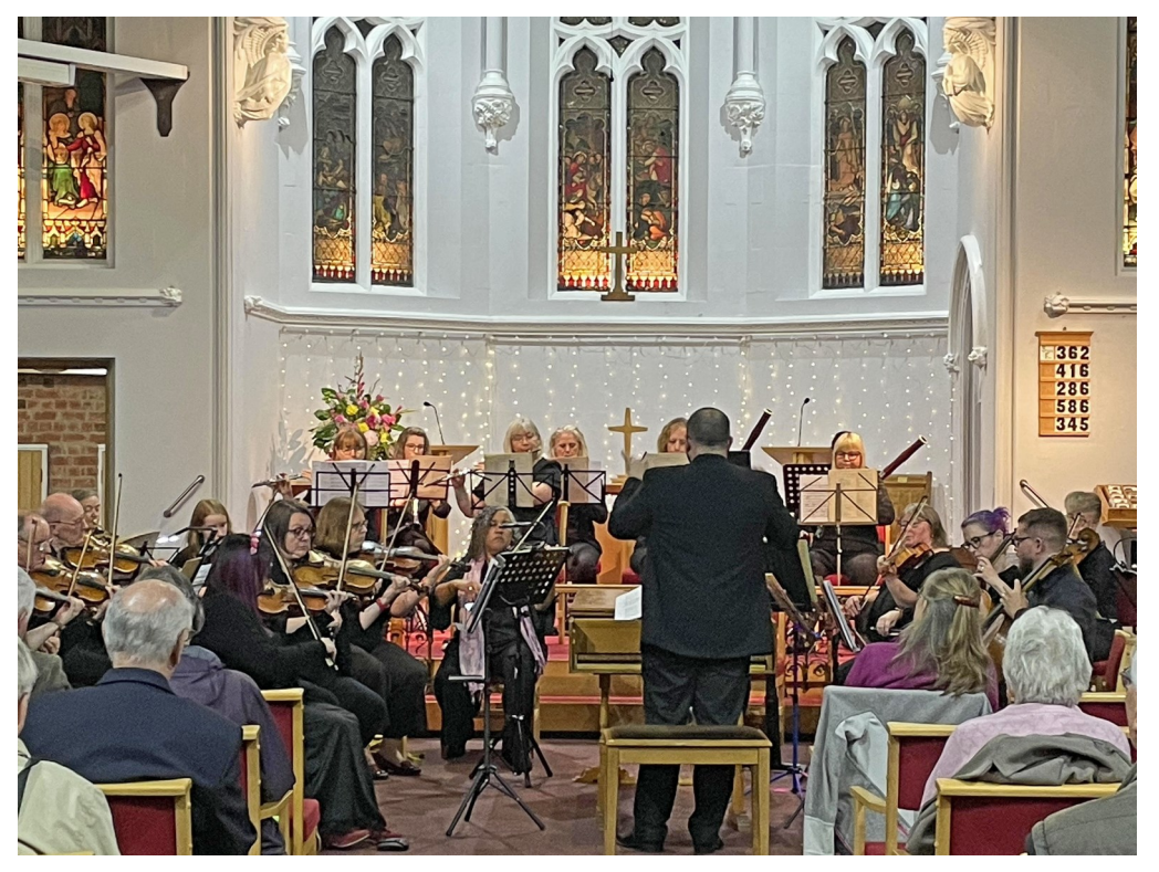
Camerata Concert in September