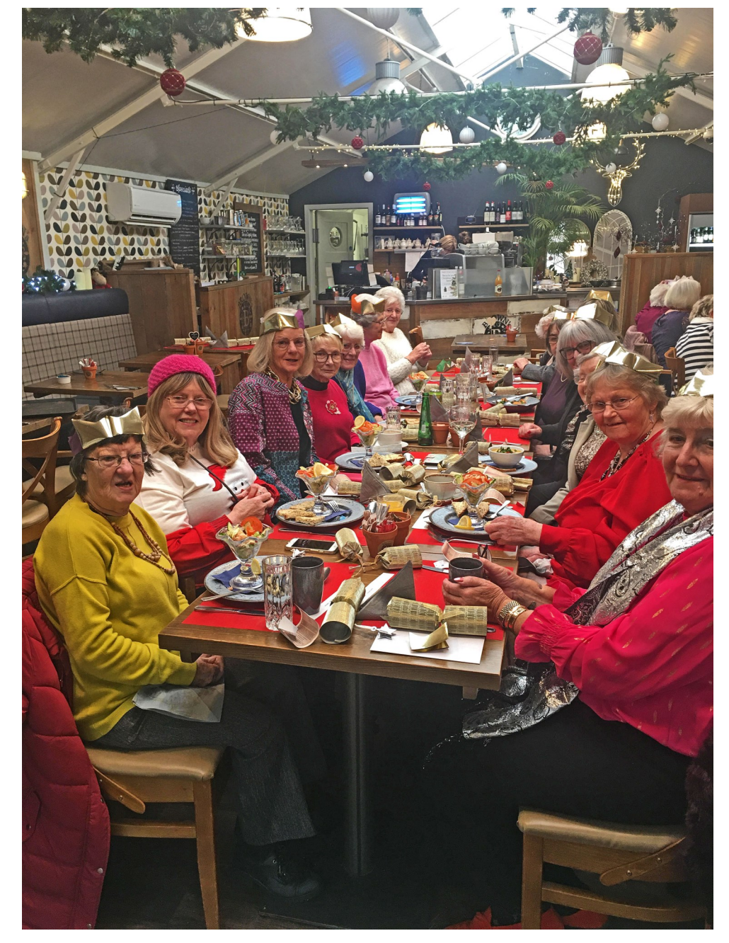
Dinner Ladies Christmas Lunch at Browns