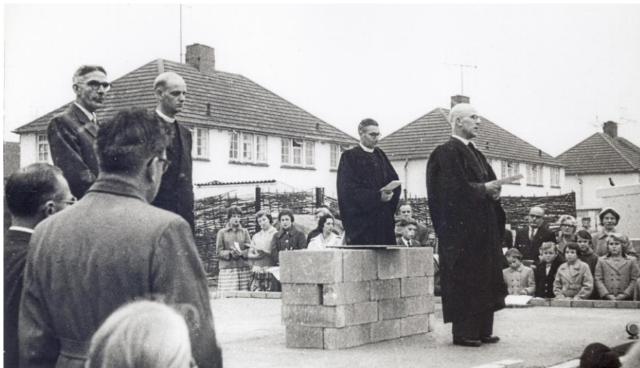
Stone laying 25 October 1958